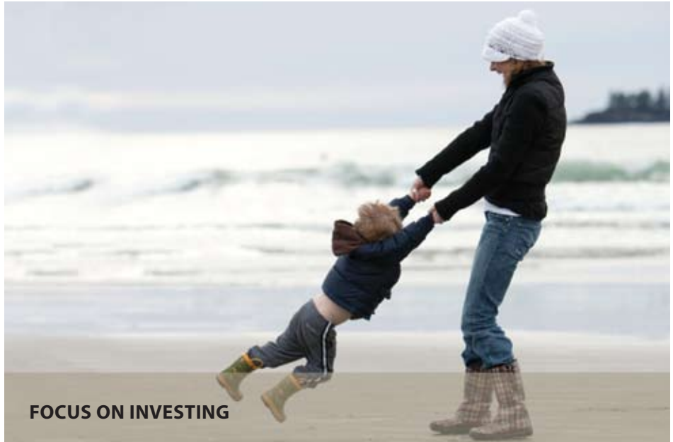
FOCUS ON INVESTING